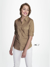
BURMA WOMEN 02764